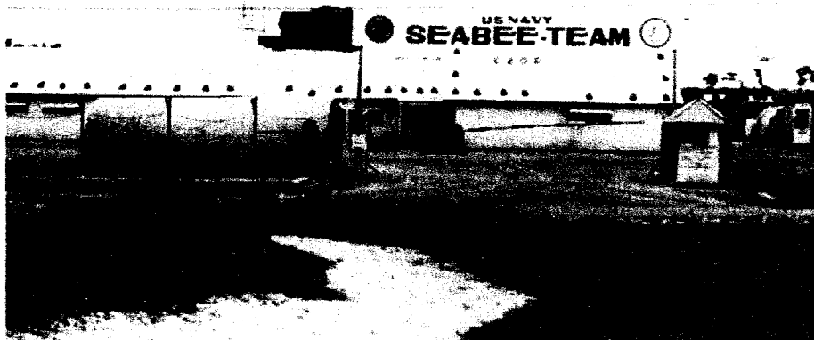
The 6206 compound

Seabee Team 6202, under the direction of LTJG David L. Burrus, deployed in May 1971 to Ham Tan in the Binh Tuy Province of South Vietnam. They completed fourteen major projects including a 2.5 km road consisting of 9,500 cubic yards of laterite fill, a two room school, a dispensary, and a village power distribution system. Their excellent performance won them the Best Type "E" for Seabee teams in Vietnam.