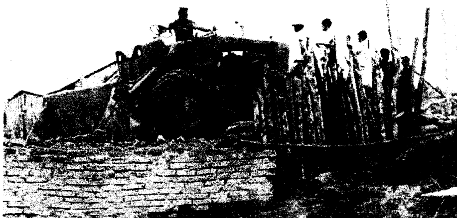
Leveling and compacting the access road to the Cham village in Ham Tan.

Seabee Team 6202, under the direction of LTJG David L. Burrus, deployed in May 1971 to Ham Tan in the Binh Tuy Province of South Vietnam. They completed fourteen major projects including a 2.5 km road consisting of 9,500 cubic yards of laterite fill, a two room school, a dispensary, and a village power distribution system. Their excellent performance won them the Best Type "E" for Seabee teams in Vietnam.