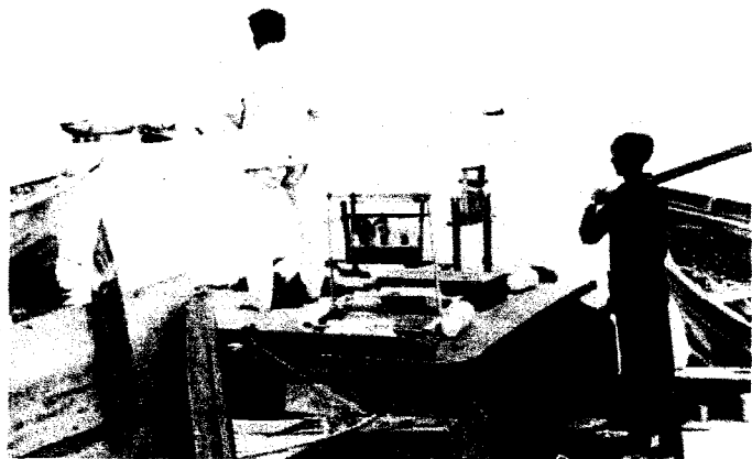
Vietnamese father and son preparing to take their fishing boat out at the Lagi seaport