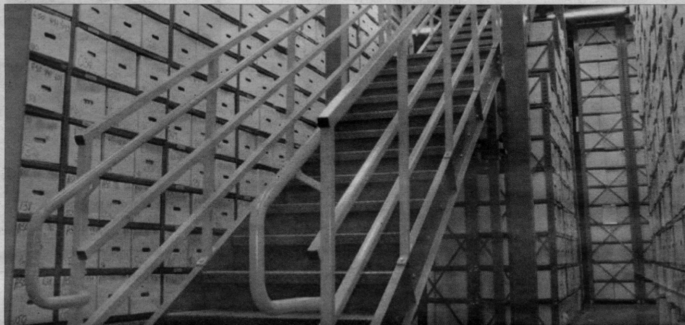
Shelves of military records go nearly 30 feet up at the National Archives in St. Louis.